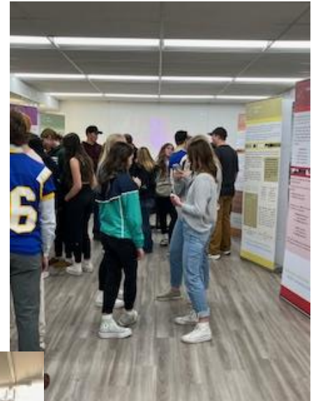
Students from the Watrous elementary and high schools explored the Cree Language display as well as other exhibits in the Heritage Centre.