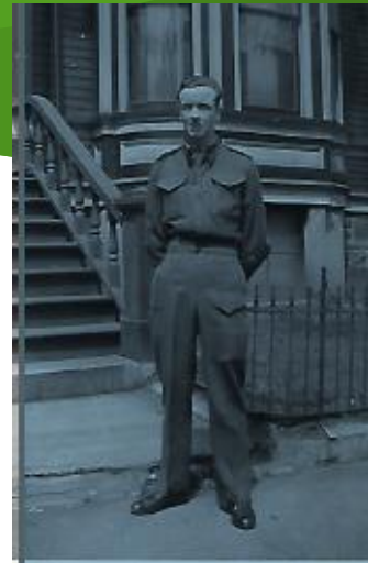
UNIFORMS WILL BE DISPLAYED ON 2 ND FLOOR IN NOVEMBER