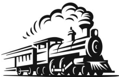
Exhibit Run: July, August, September

TRAVELLING RAILWAY PHOTOGRAPH EXHIBIT COMING OCTOBER 15 TH