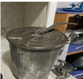
Bread Maker - 1904

Did you know that bread makers have been around since the early 1900's? This bread maker, displayed in the Allan museum's kitchen was awarded a gold medal at the St. Louis exposition in 1904. Makes up to 4 loaves.