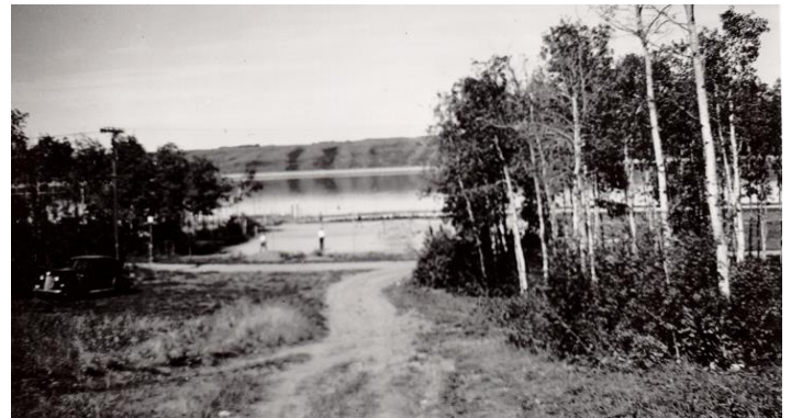
Taken from Park St., now called Shawondasse Drive, at Manitou Beach