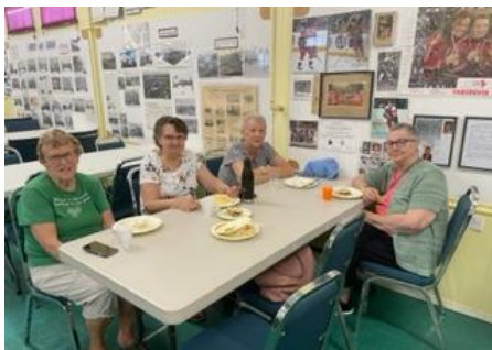
Enjoying a homemade lunch.