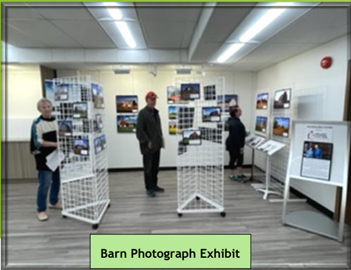
Barn Photograph Exhibit