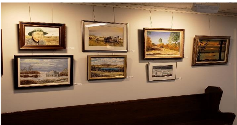
A section of the art exhibit displayed in the Centre during the summer.